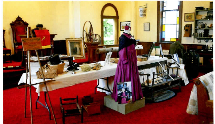
The Pierce Family Collection