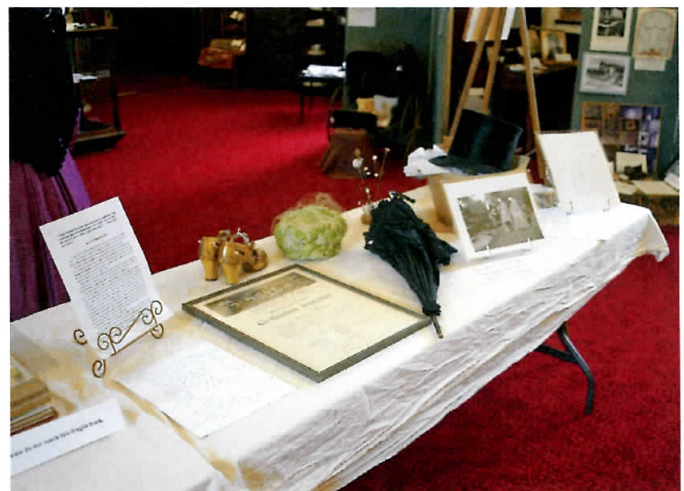
Hat, pin holder, gold shoes, black parasol and photo.