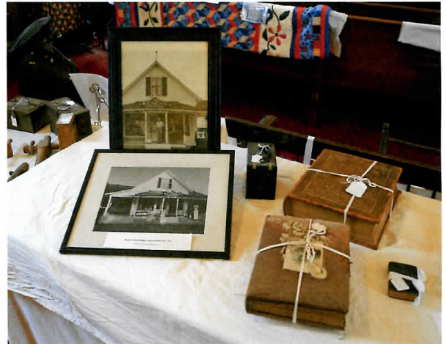
Store photos, albums, miniature diary and a box camera.